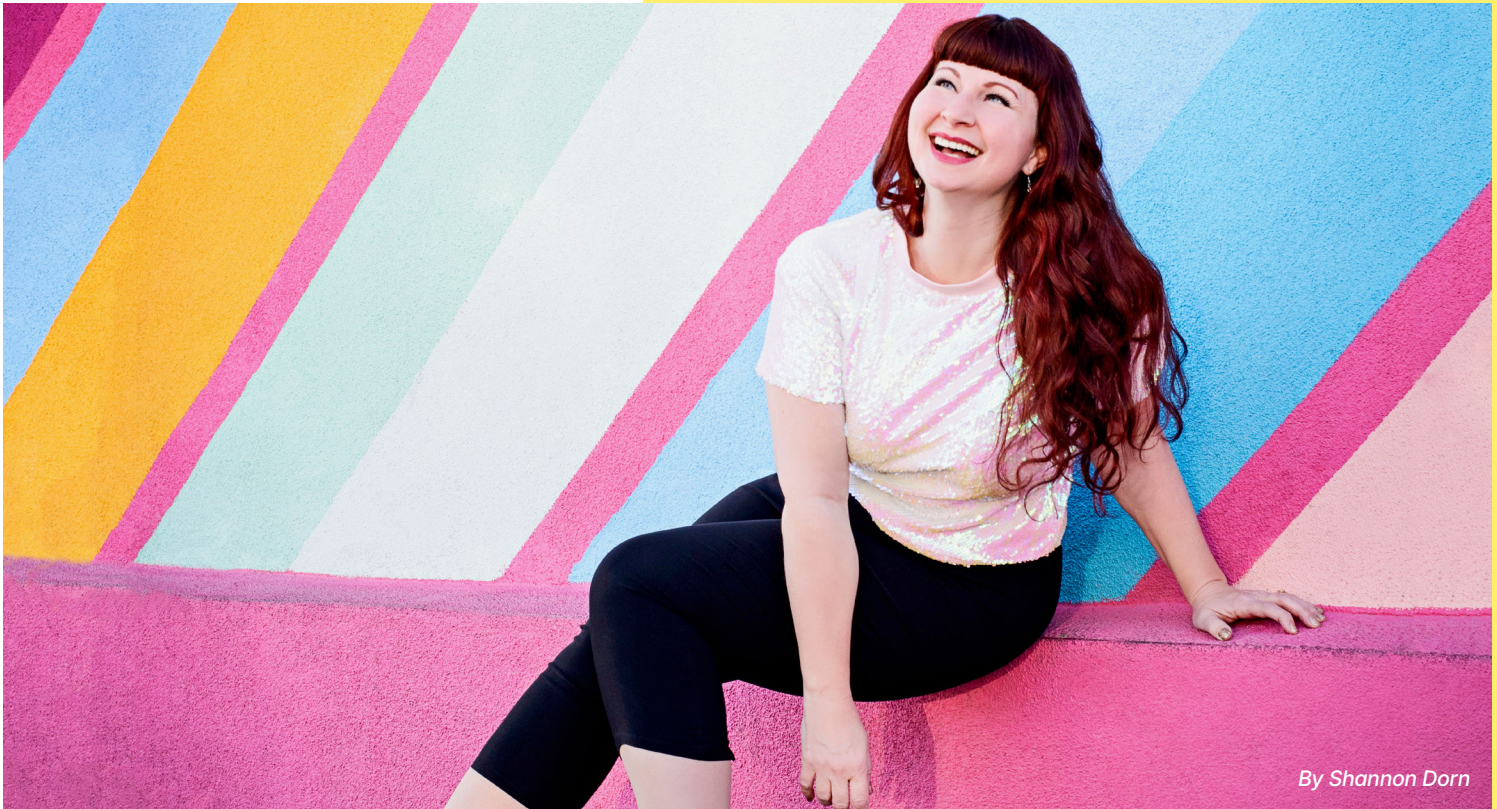
By Shannon Dorn