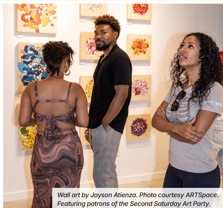
Wall art by Jayson Atienza. Featuring patrons of the Second Saturday Art Party.