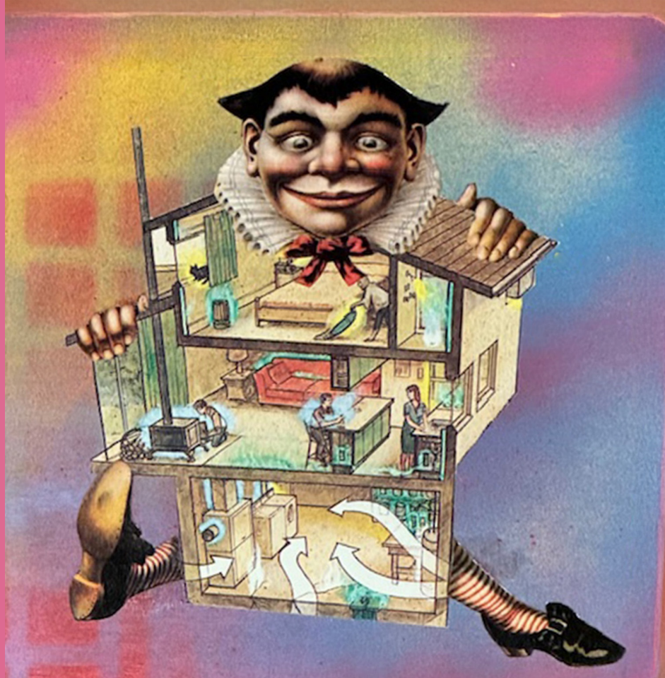
Art By 3 BAAAD Sheep

Whether you're testing a small batch or stocking for high traffic, we'll work with your space.